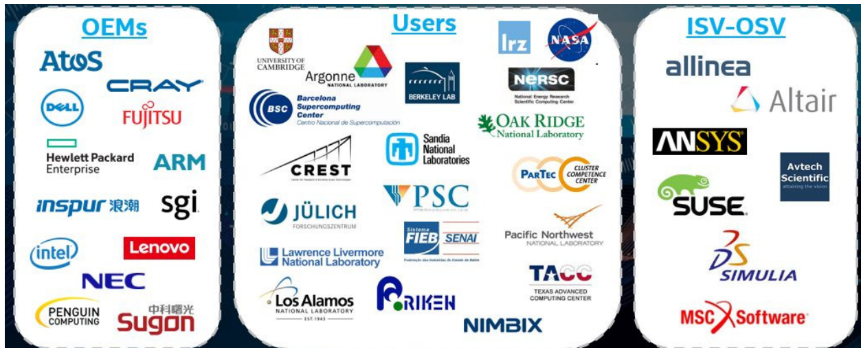
Figure 1: OpenHPC participation as of May 3, 2016